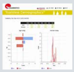
View demographics statistics directly in the unit by pointing your web browser to its URL

TrueView Demographics® generates statistics on the store visitors. It obtains the absolute values of male to female visitors and age.